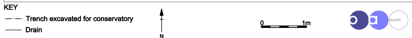
Figure 2 : Trench monitored under watching brief