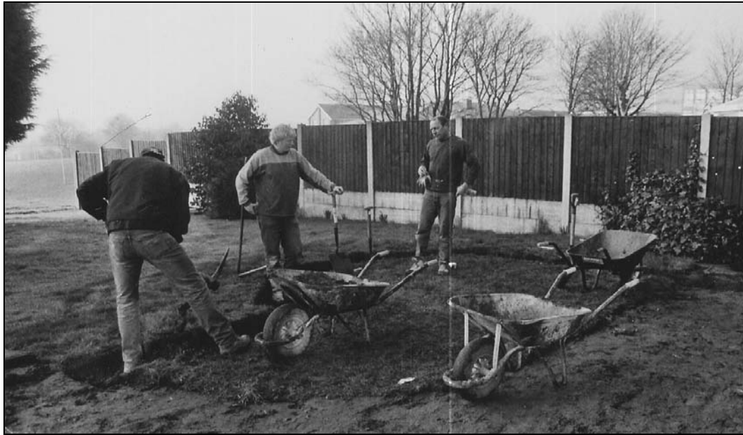
Plate 1: Working shot of the manual excavation of trenches for the conservatory