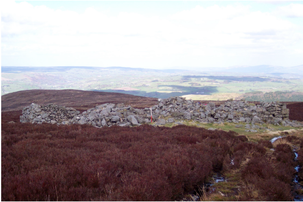
Plate 5: Liberty Hall shooting lodge (NMR 281012)