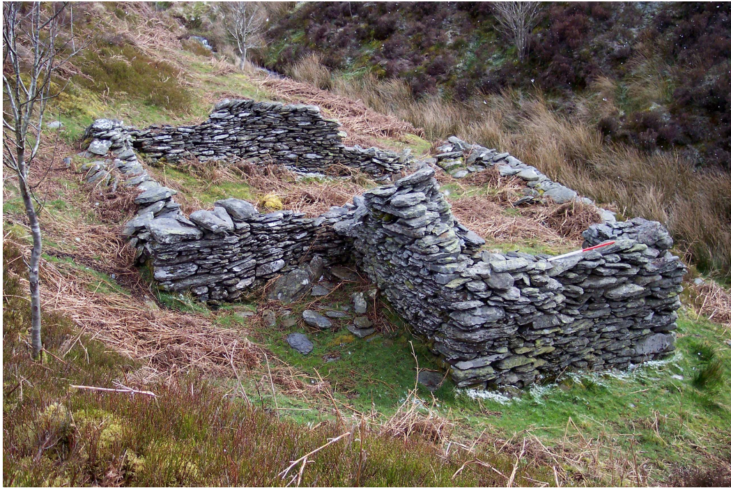
Plate 7: Nant Fach sheep fold I (NMR 281005)