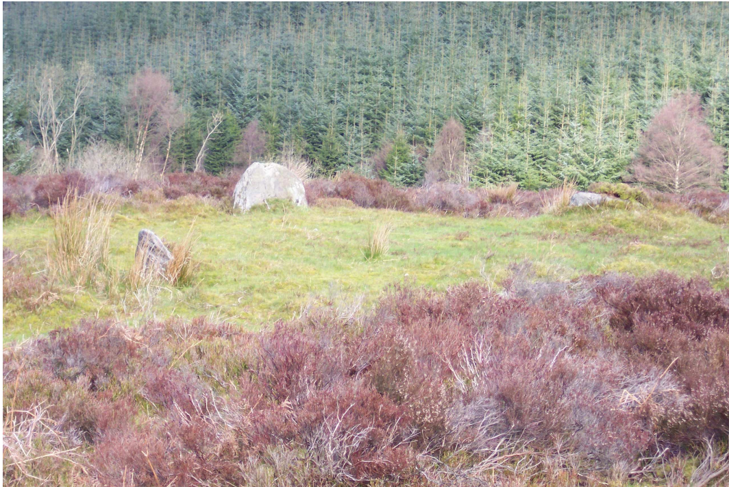
Plate 1: Nant Croes-y-wernen variant stone circle (NMR 281135)