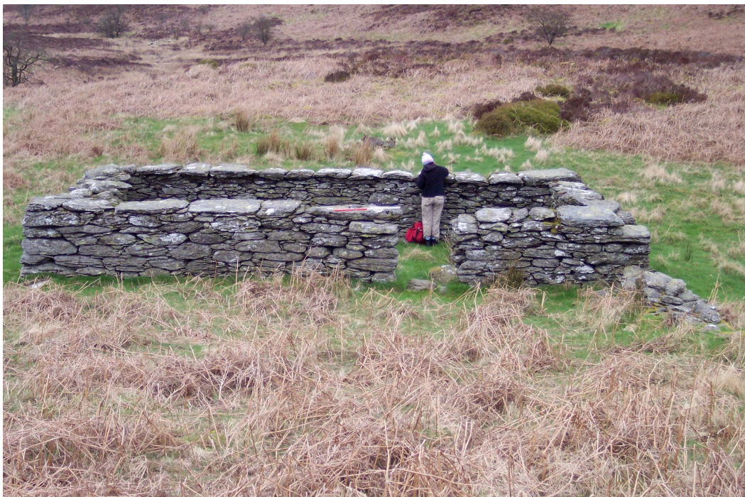
Plate 6: Creigiau Llangar sheep fold I (NMR 281009)