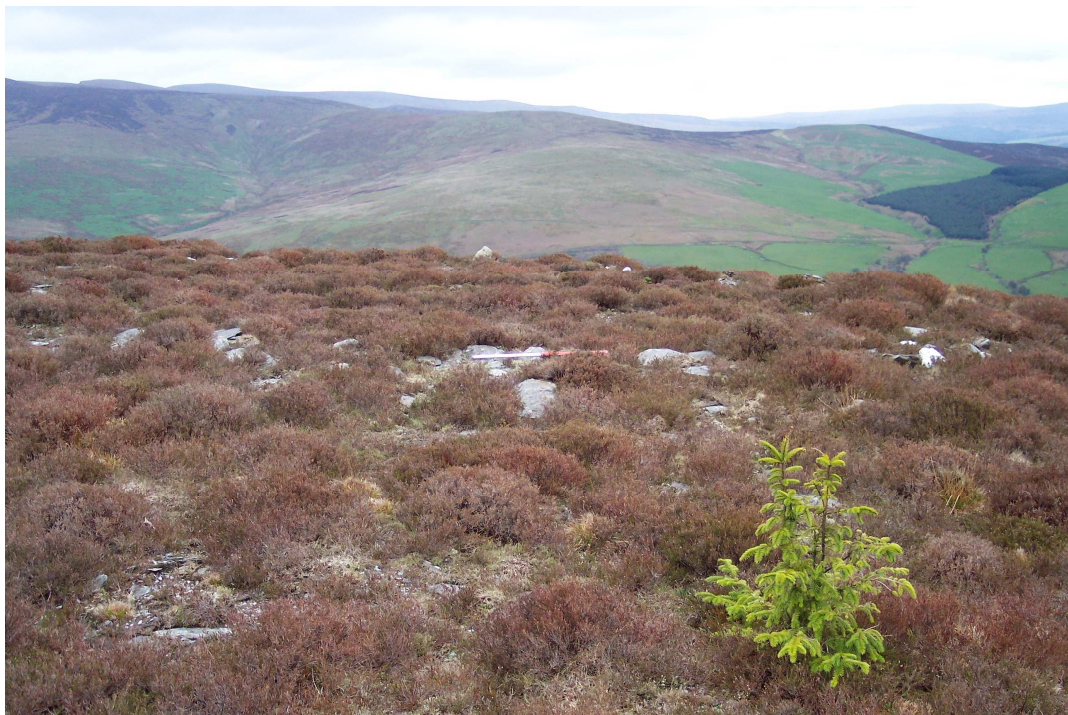
Plate 2: Moel yr Henfaes ring cairn (NMR 281160)