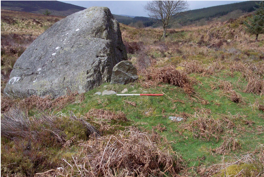
Plate 3: Nant Croes-y-wernen clearance cairn (NMR 281107)