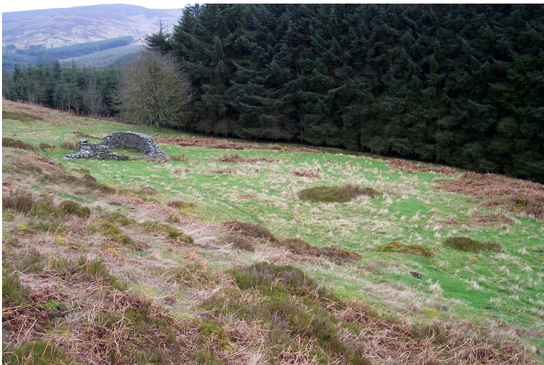
Plate 4: Celyngoed farmstead (NMR 281018)