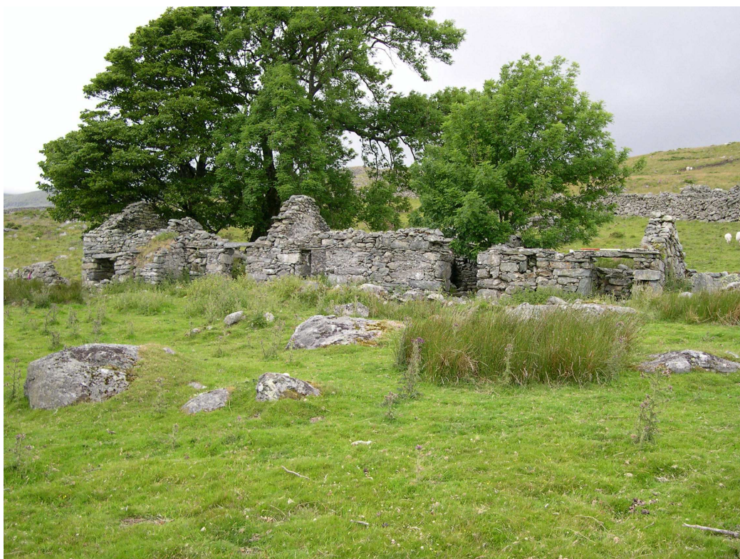
Plate 5: Farmstead at Ffrith-y-Bont (NMR 279146)