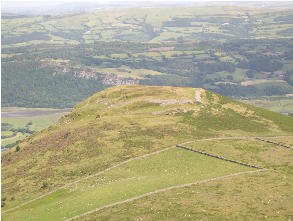
Plate 1: Pen-y-gaer hillfort overlooking the Conwy valley (NMR 95289)