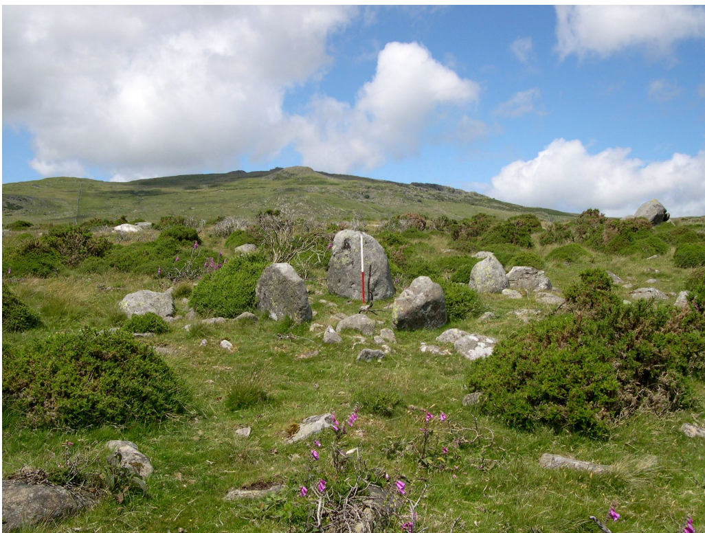
Plate 2: Ring Cairn located to the south of Hafodygors-wen (NMR 308030)