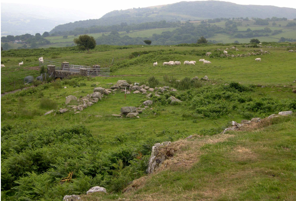
Plate 3: Longhouse settlement south of Pen-y-gaer (NMR 302044)