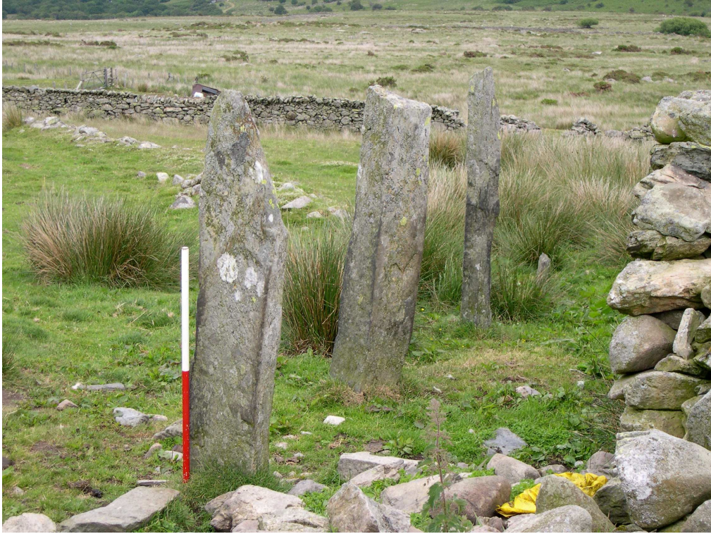
Plate 7: Upright orthostatic stone structure at Ffrith-y-bont (NMR 279061)