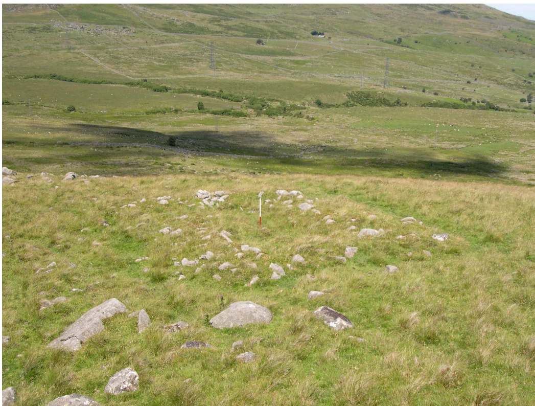
Plate 4: Longhouse on northern slope of Penygadair (NMR 279161)