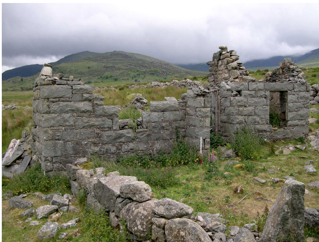
Plate 6: Farmstead at Hafodygors-wen (NMR 279053)