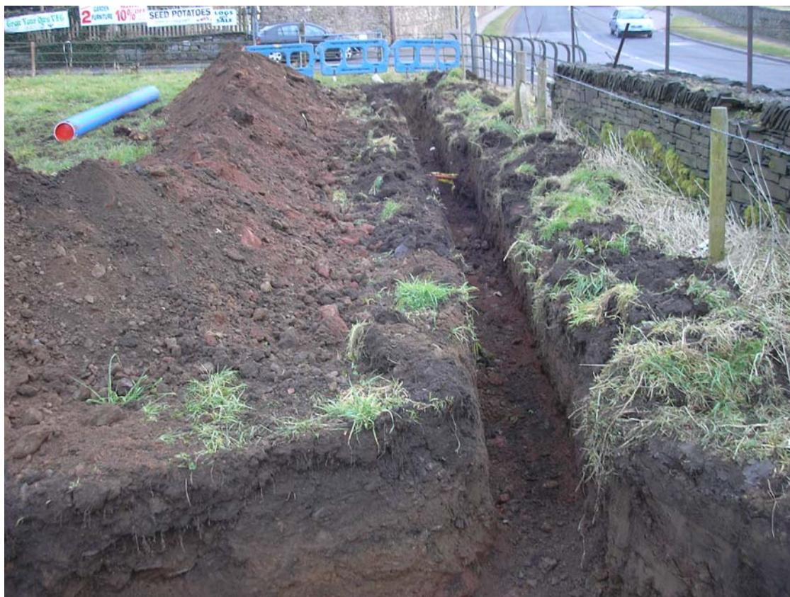
Plate 2: General shot of pipe trench in Field 2, Pennington Lane