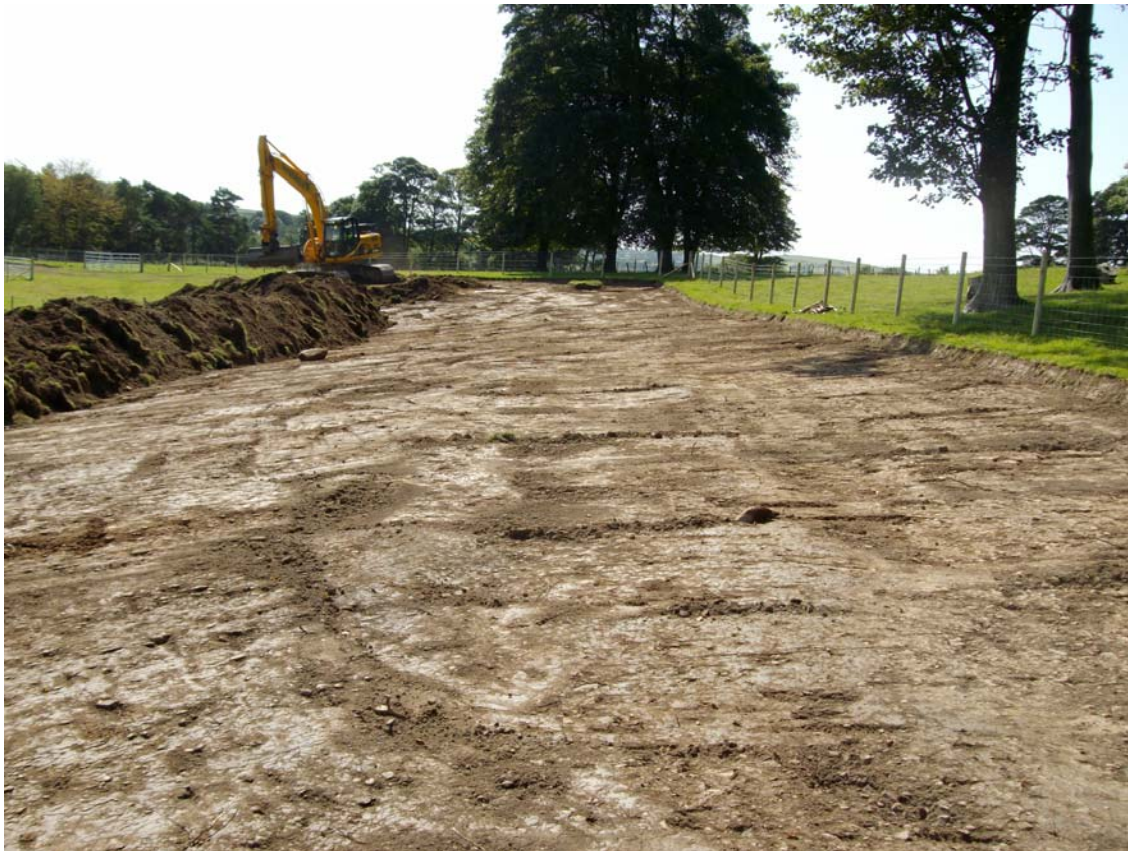
Plate 1: General shot of the easement during topsoil stripping activities