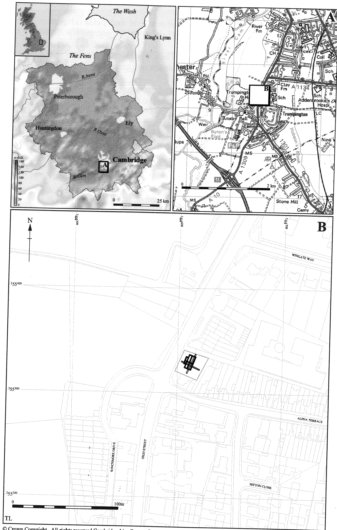
Figure 3 Location of foundation trenches (black) and evaluation trenches (grey) with the development area outlined (red)