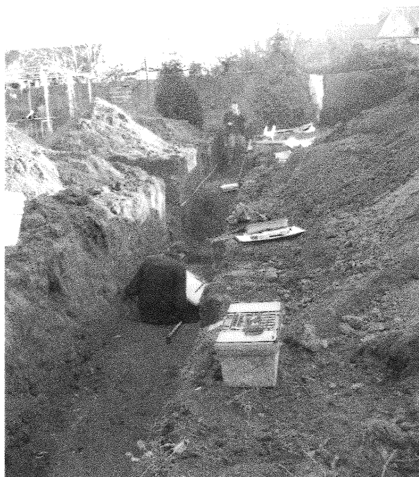
Plate 1 Trench 1 from the west. The figure in the foreground is sitting in ditch 05, while the figure at the back is standing on the east edge of pit 03.

Beyond the western edge of these pits and running parallel with the modern High Street, was a small ditch (05) 72cm wide and 23cm deep. Its fill (04) was a dark greyish brown silty sand with moderate gravel and late medieval pottery.