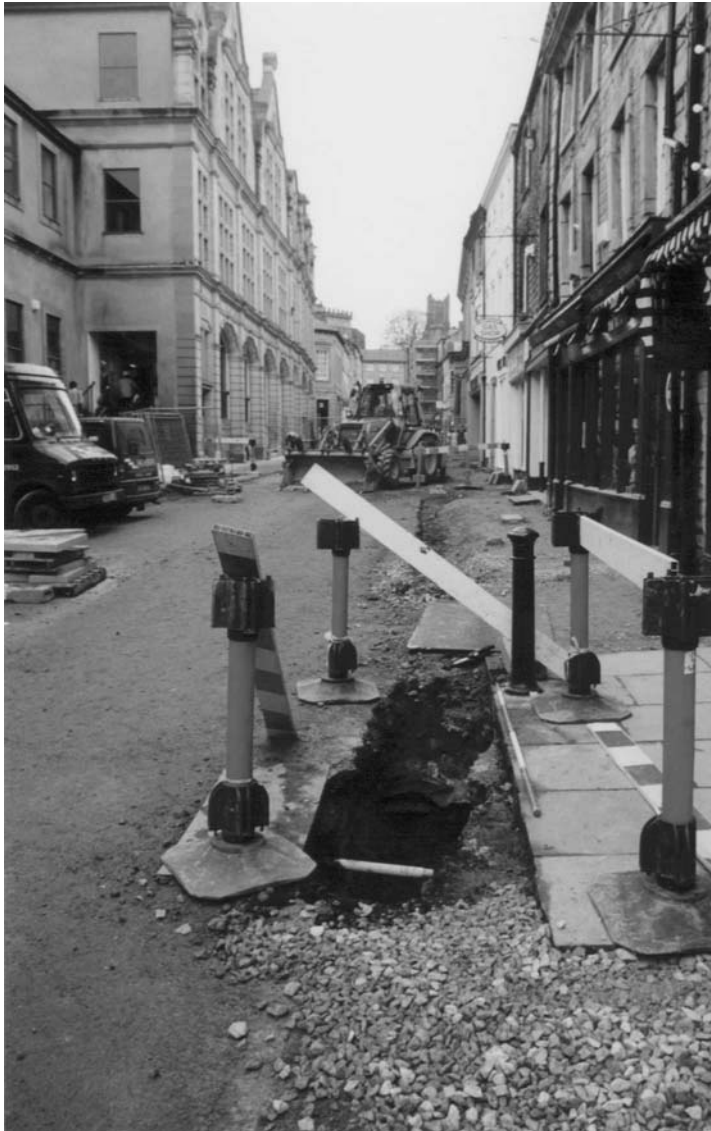
Plate 1 Surface view of No 44 Cellar exposure - > NW