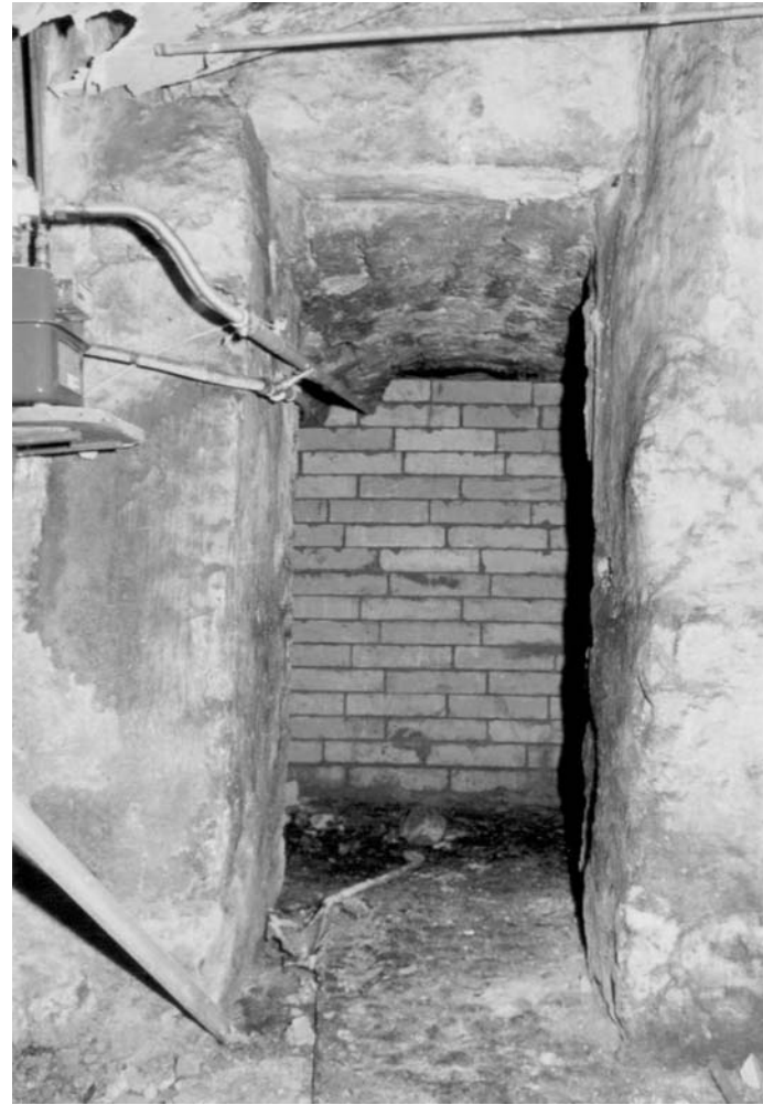
Plate 4 No 44 cellar entrance through principal façade looking south-west