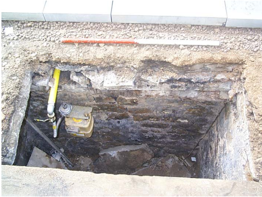
Plate 5 No 52 Church Street cellar viewed from street > north-east