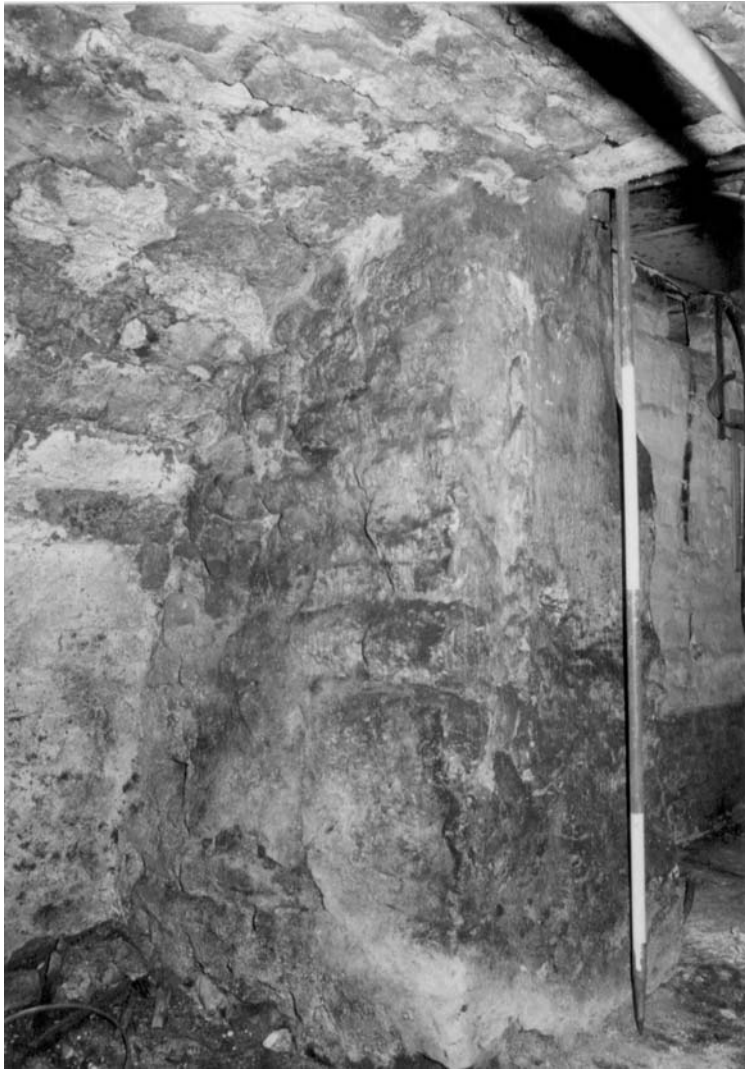
Plate 3 No 44 cellar entrance through principal façade viewed From within Cellar > north-east