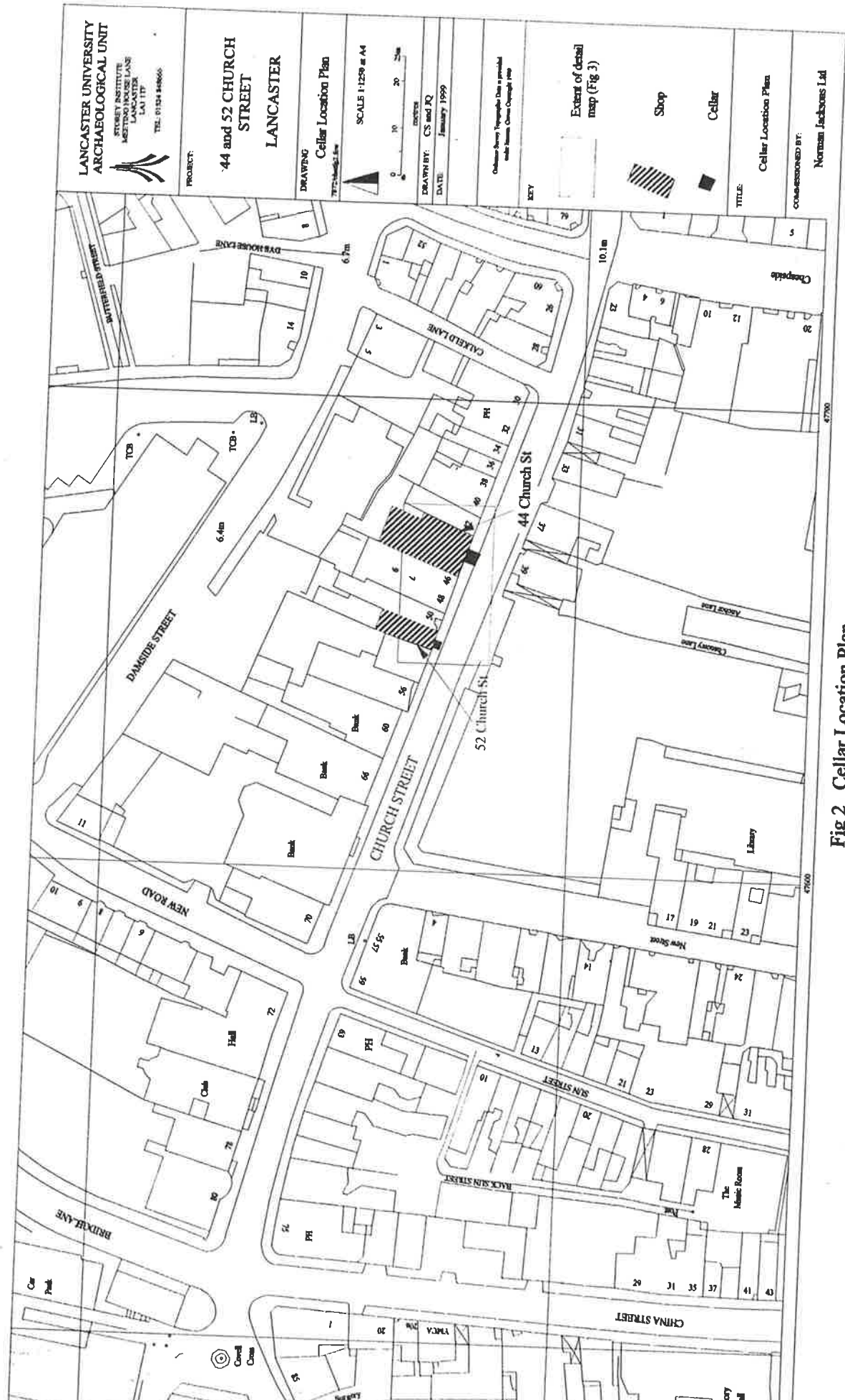
Fig 2 Cellar Location Plan