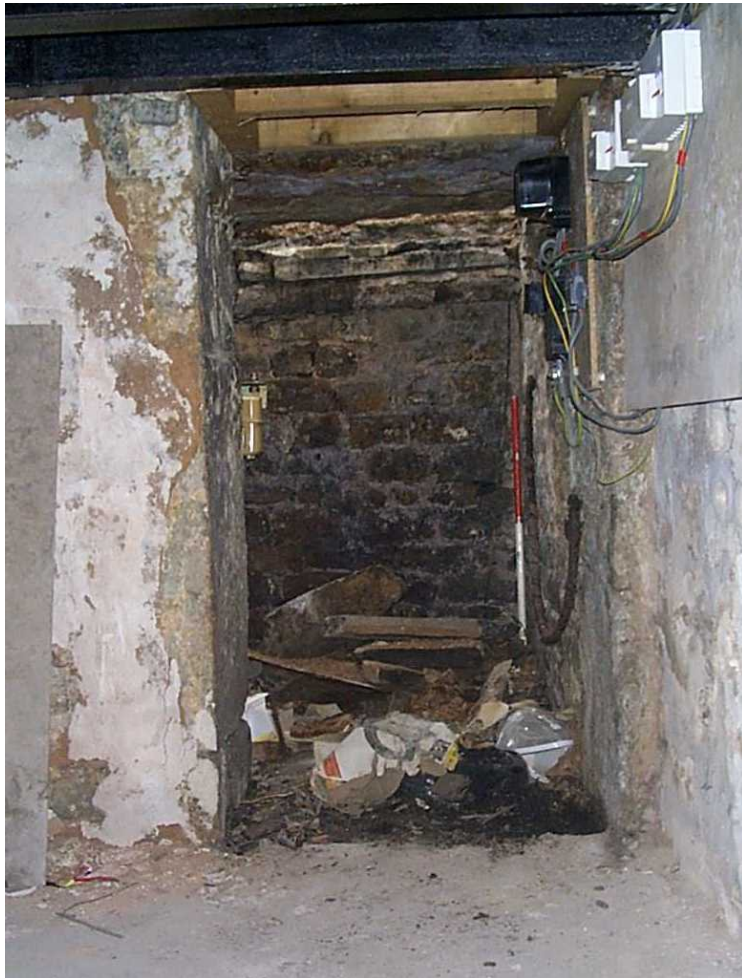
Plate 6 52 Church St. entrance into cellar through principal façade > south-west