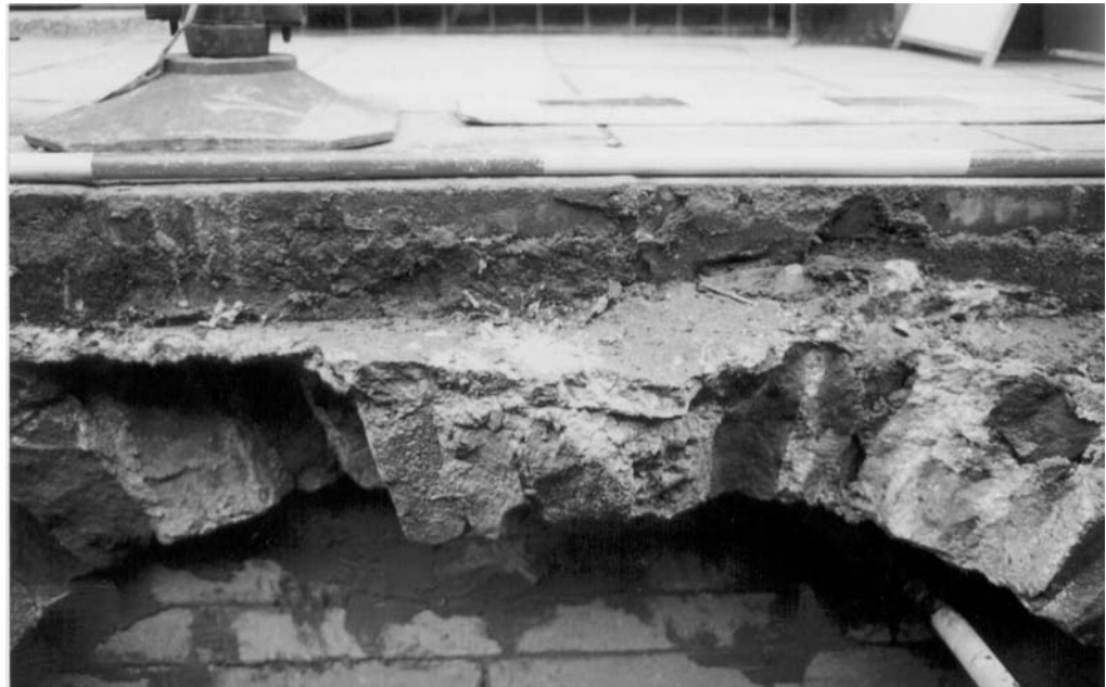
Plate 2 Crown of No 44 barrel vault in relation to pavement surface > NE