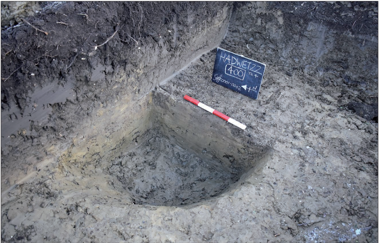
Plate 2: Pit 400, showing the west-facing section