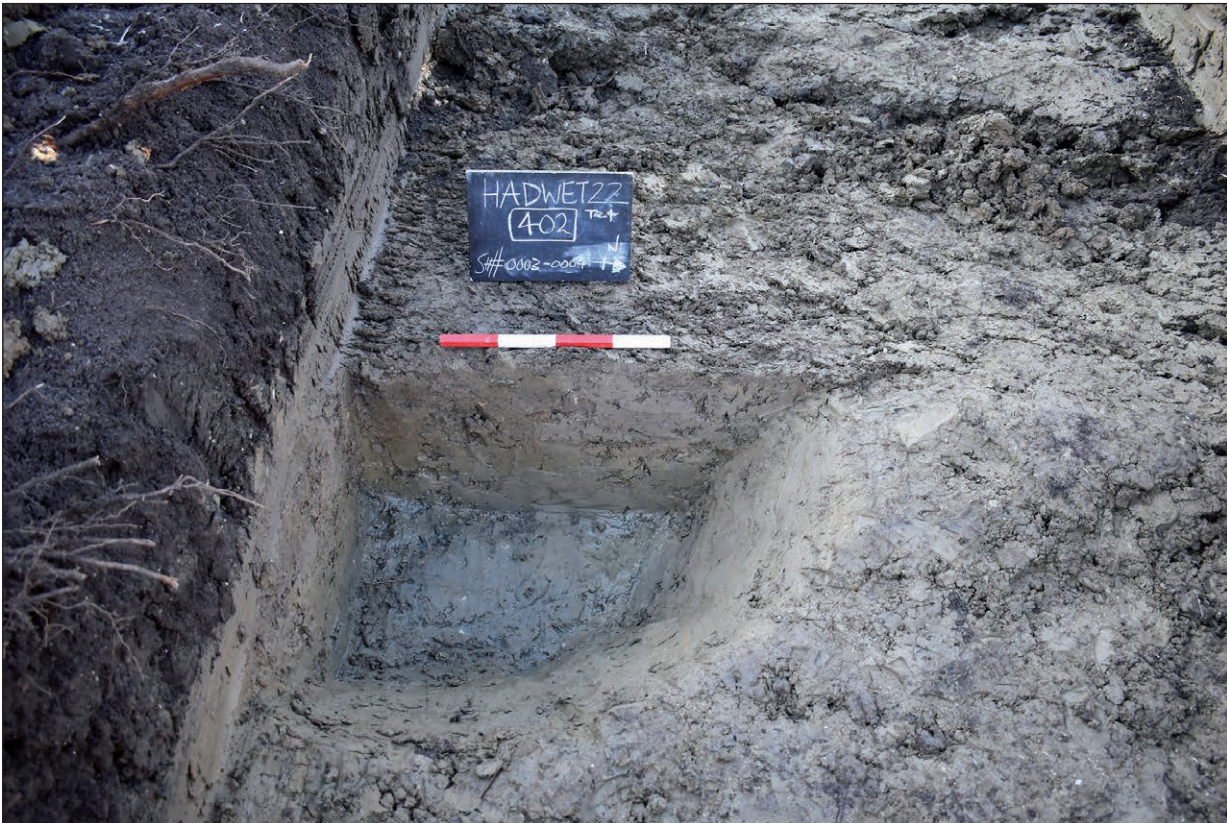
Plate 3: Pit 402, showing the east-facing section