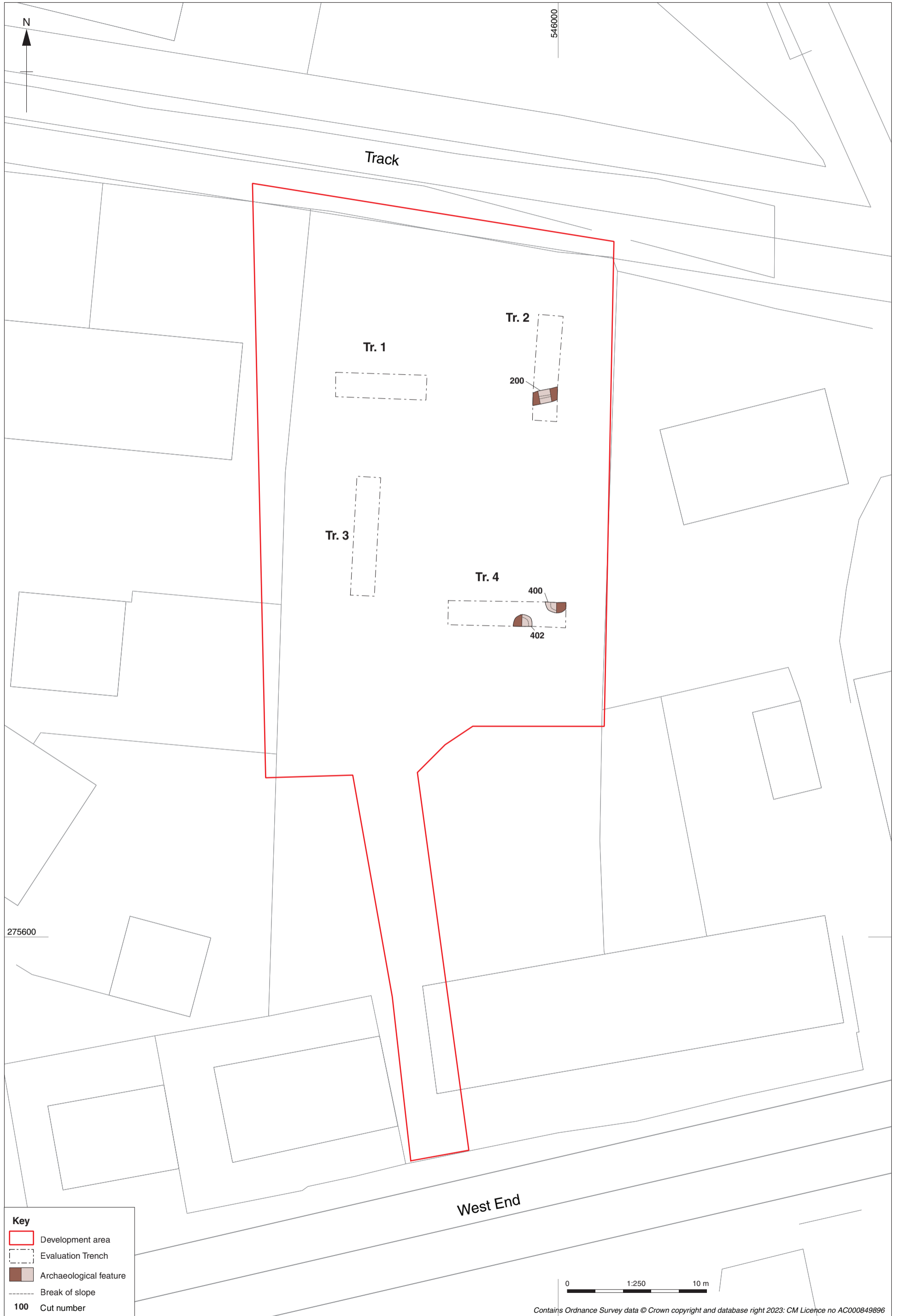
Figure 3: Plan of evaluation trenches