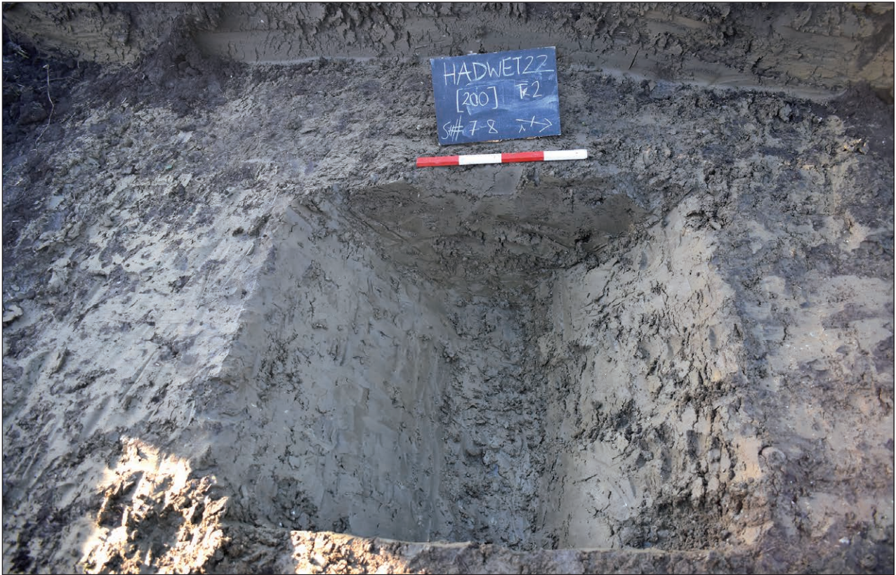
Plate 1: Ditch 200, showing the north-east facing section