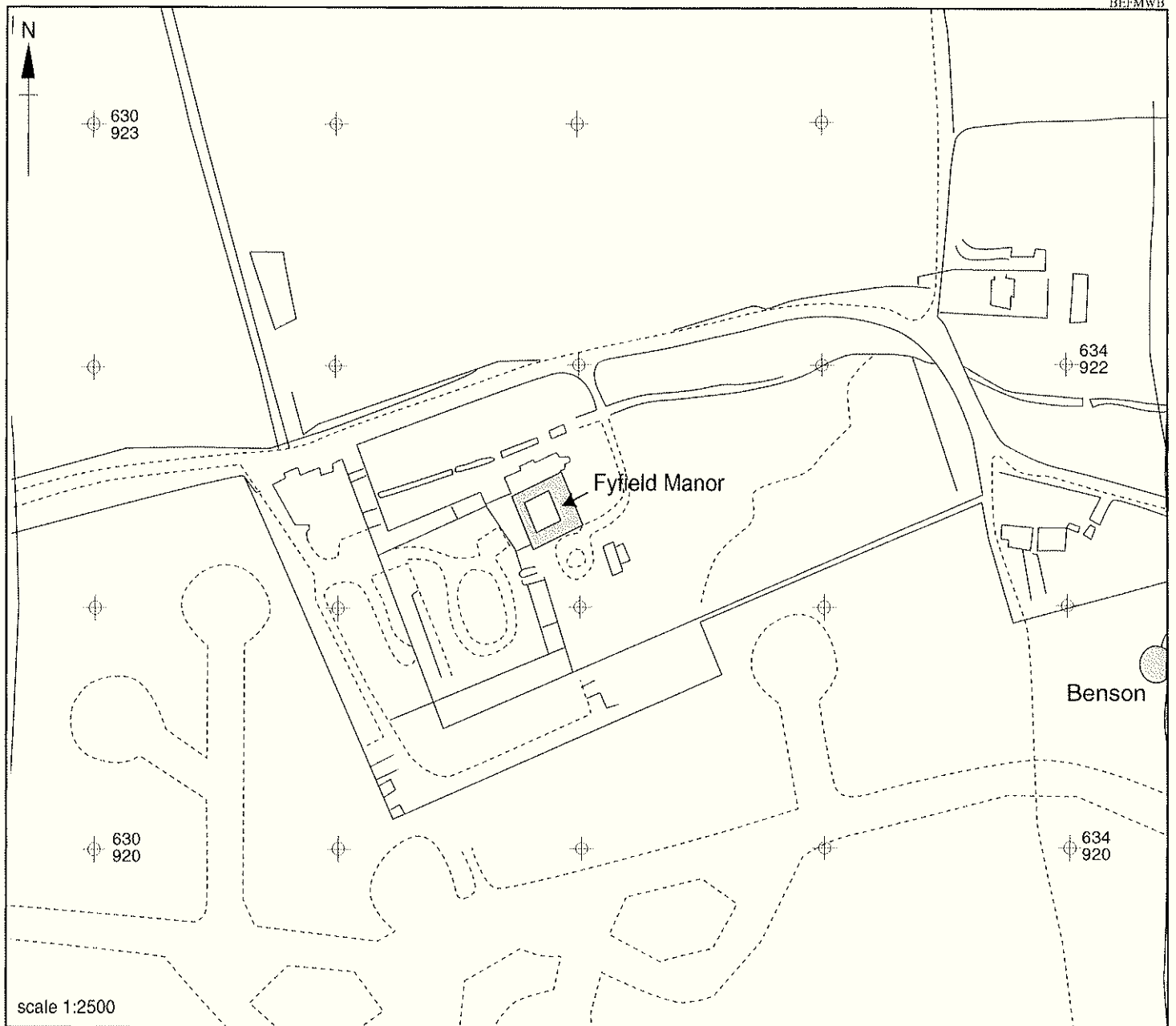
Figure 2: Site location plan.